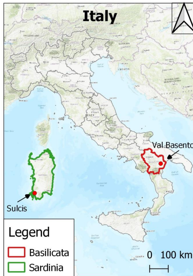
Figure 1: Study areas in Sardinia and Basilicata region, Italy.

This study focuses on two areas located in Southern Italy: the area of Sulcis in the region of Sardinia (39°09' North latitude, 8°29' West longitude) and the Basento valley in the region of Basilicata (40°46' North latitude, 16°46' West longitude) (Fig. 1). Both of the selected case study areas are among the “Sites of National Interest” (SIN as per their acronym in Italian) [12], which include polluted industrial and mining areas across the Italian territory. The two case study areas were selected among SIN areas as they exhibit marginality, disadvantages, and physical limitations such as poor soil capacity for crop productivity, degraded and contaminated soils, underutilized soils, barren and idle lands, and distance to markets [4]. The selection of the Basilicata Region follows a survey of potential study areas that identified in the Basento Valley the presence of an industrial area and an established biorefinery in the Ferrandina (Matera province). The Sulcis study area has been selected as a follow-up from the H2020 FORBIO project [13].