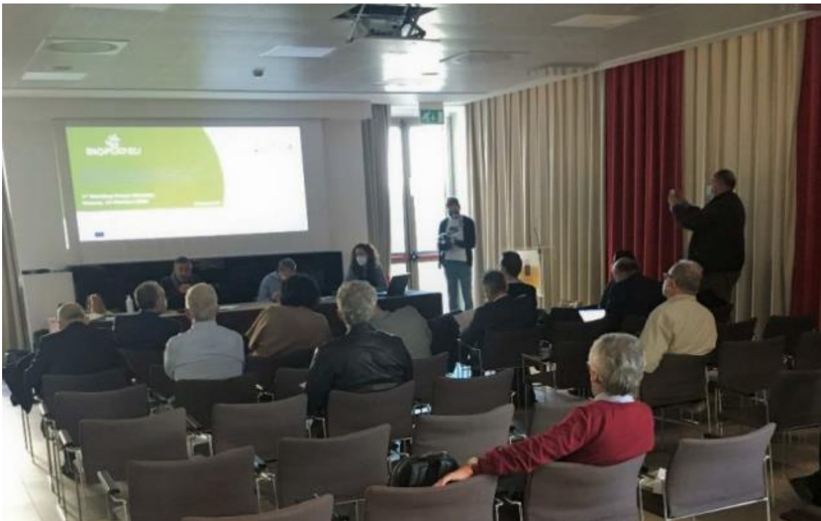
Figure 3: Working Group Meeting held in Matera on October 14, 2020.

The first MSWG meeting of the project in the Basilicata region was held in Matera in October 2020 and saw the participation of 20 participants. (Fig. 3).