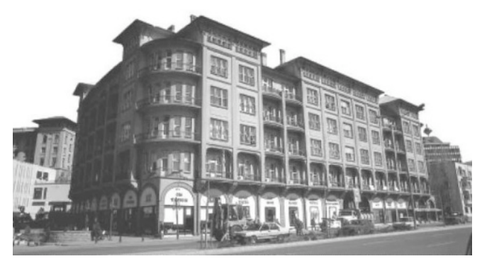
Figure 1: Architect Kemalettin Bey, Foundation Apartment, Ankara, 1926-27.

ideology of the Republic, and even the arrival of the new architecture was celebrated with an official article in 1930. Considering the importance of newspapers in the making of a unified nationalist consciousness, the appearance of major feature article on modern architecture testifies to strong ideological significance attached to it by the republican regime [7]. In the architectural experience of the new republic, the 1<sup>st</sup> and 2<sup>nd</sup> national architectural periods, which had the characteristic of being a style search based on the discovery and use of the national architectural elements, prevailed until the 1950s. In this period, public buildings with modern-monumental characteristics were built and research was performed on the traditional Turkish house [8]. However, following the period in which the regional changes began to take place in modern architecture in the worldwide, the modern architecture began to become widespread in 1950's. The modernist movement coming from the West was just a fad, moreover a delayed fad, among the architects. And the problems of the architects, whose number was still inadequate, were not the problems of the common people due to the class they came from [9]. Change life! Change society! These precepts mean nothing without the production of an appropriate space [10]. This quotation from Lefebvre summarizes the reason of the spatial problems of the new republic.