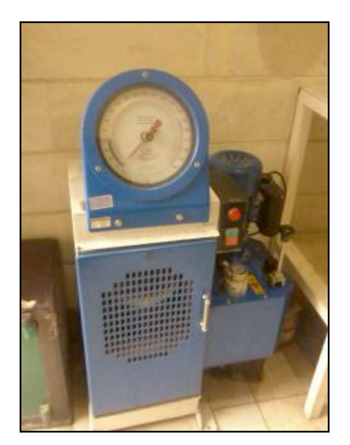
Figure 2: kit for compressive strength measurement.