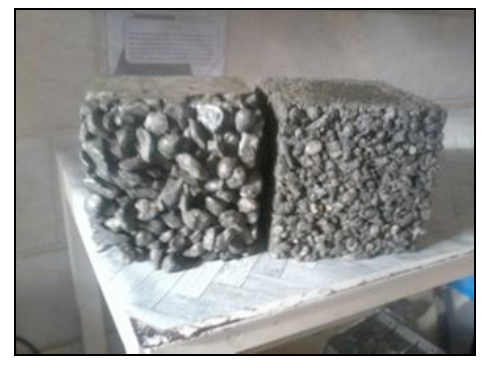
Figure 1: Samples of FPC and CPC.

All mixtures were produced using single size aggregate and only Portland cement and water-tocement ratio (W/C) of 0.28, 0.3, 0.32, and 0.34. 1400kg aggregates were used for making one cubic meter of PC mixes. The W/C was incrementally changed from 0.28 to 0.34. In this way, Samples of different porosity were obtained. PC mixes was made from fine aggregates was named fine porous concrete (FPC), and PC mixes was made from coarse aggregates was named coarse porous concrete (CPC). All Mixtures were proportioned to achieve appropriate permeability coefficient and porosity. Standard 150mm cubic sample were used for 28-day compressive strength tests on hardened PC. All specimens were de-moulded after 24h and stored in the curing room at approximately 95% relative humidity. The compressive strength was reported based on the average of three samples. Picture of FPC sample and CPC is shown in Figure 1.