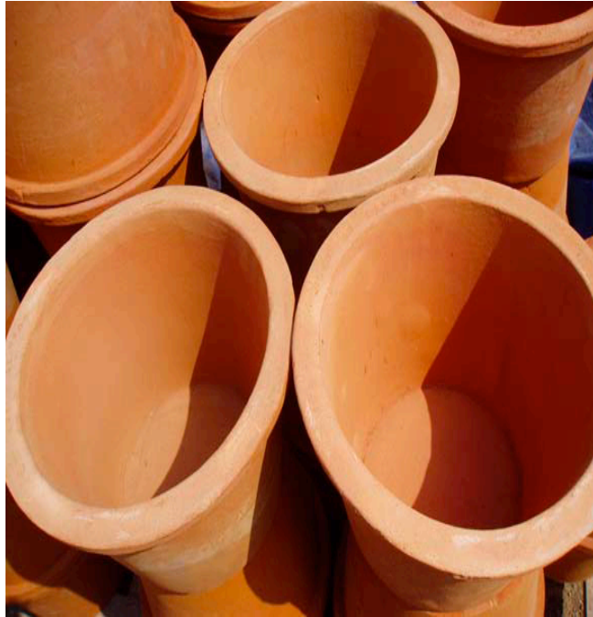
Figure 4: Ease of Storage of CWFs.

locally available prior to emergencies is that if adequate stocks are maintained, the filters can be deployed quickly and efficiently.