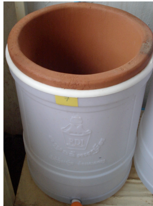
Figure 2: Ceramic Filter Retained in a Plastic Receptacle, Outlet Spigot from the Receptacle at Bottom.

CWFs have been shown to effectively remove E. coli from drinking water (Murphy et al. , 2010a, b). Bacteria generally range in length from 1-50 \mu\text{m} and rod-shaped bacteria (including E. coli ) are 0.3-1.5 \mu\text{m} in diameter and 1-10 \mu\text{m} in length (Tchobanoglous et al. , 2003). E. coli is gram-negative, flagellated,